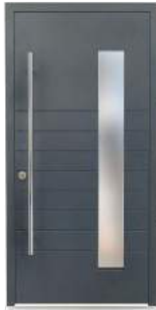
Colour: SEN015 Ashwell DM0002