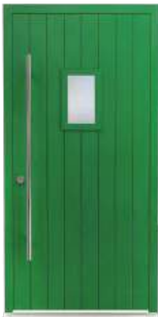
Colour: CTN003 Purton DT0011