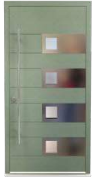
Colour: SEN018 Highgate DM0010