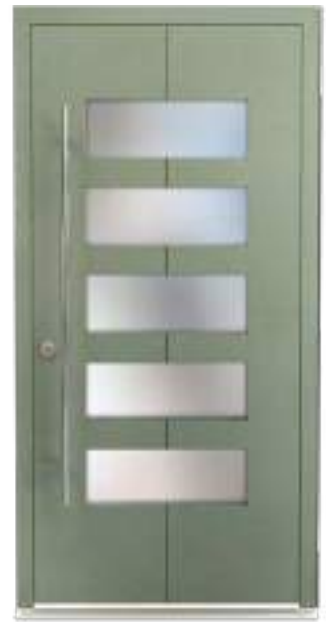
Colour: SEN018 Pembroke DM0016