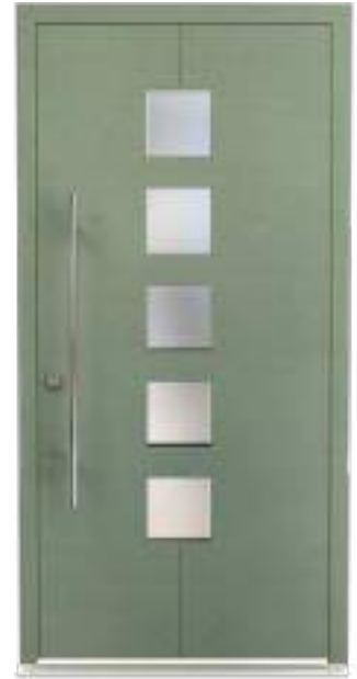
Colour: SEN018 Lymington DM0013