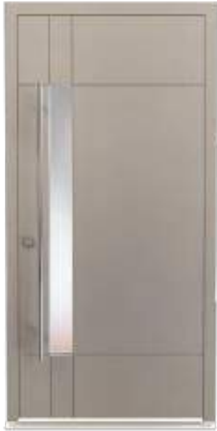
Colour: SEN026 Clifton DM0006