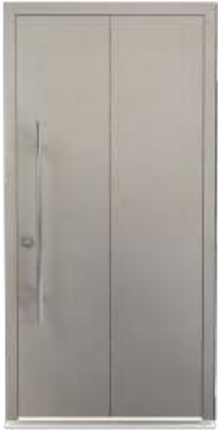
Colour: SEN025 Canonbury DM0005