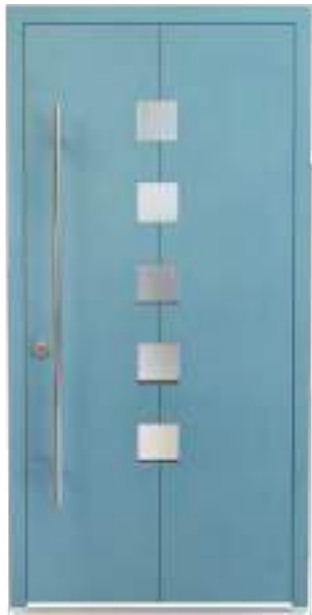
Colour: SEN028 Falmouth DM0008