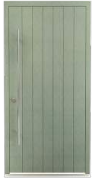
Colour: SEN018 Hambleton DM0009