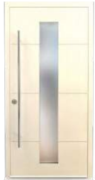
Colour: CWD002 Amersham DM0001