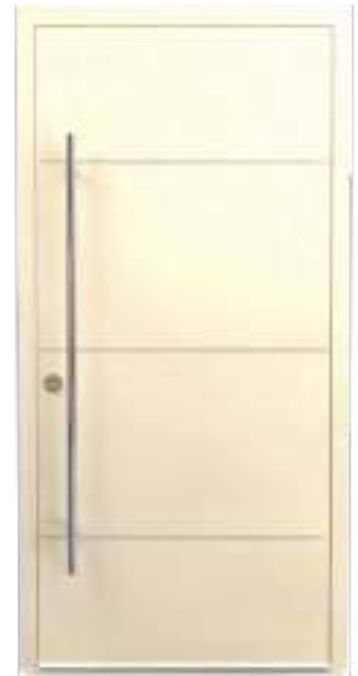
Colour: CWD002 Sherbourne DM0021