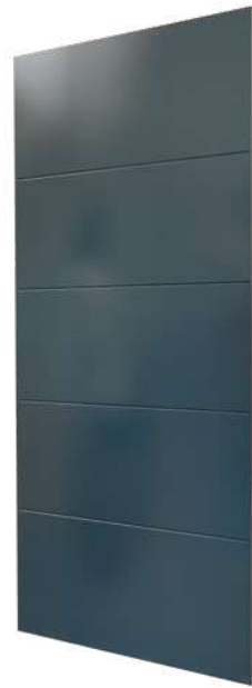
Textured Anthracite KL14ST Anthracite Grey KL005