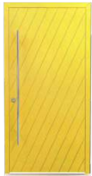
Colour: CTN006 Axbridge DT0009