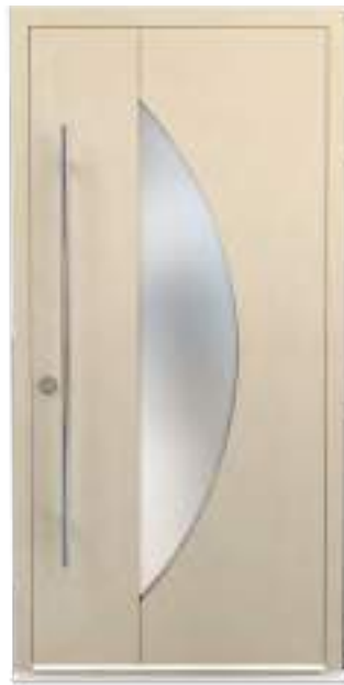
Colour: CWD004 Richmond DM0022