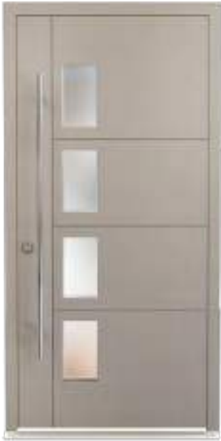
Colour: SEN026 Broadstone DM0004