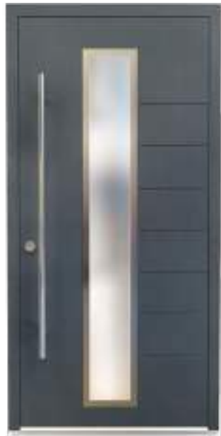
Colour: SEN015 Kensington DM0012