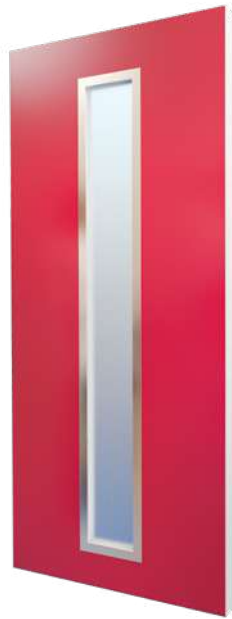
Westonbirt Leaf CWD014

Designer panels are available in Smarts Sensations, Cotswold, Naturals and also RAL colour ranges.