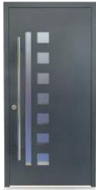
Colour: SEN015 Kingsbridge DM0011