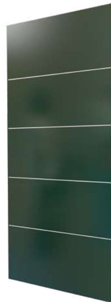
Amazon Green SEN011