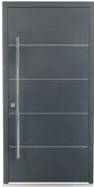
Colour: SEN015 Oxford DM0031