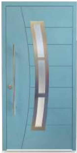
Colour: SEN028 Marlborough DM0014