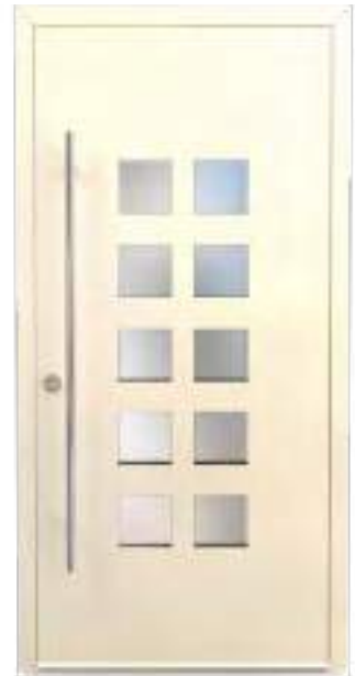
Colour: CWD002 Purbeck DM0018