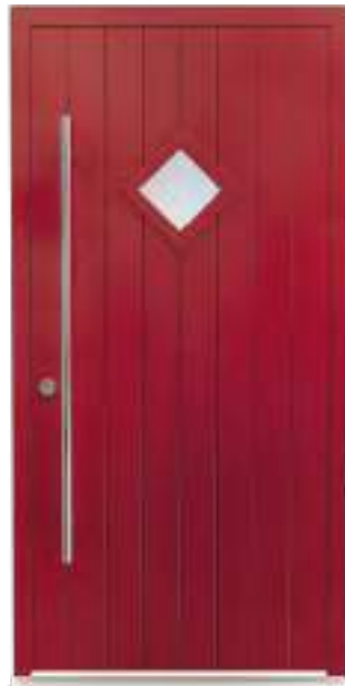
Colour: CTN005 Coleford DT0008

Whether it's a replacement for an existing door or a new build project, you can tailor the door to meet your exact aesthetic, security and performance requirements.