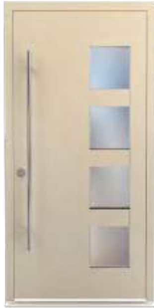
Colour: CWD004 Shipston DM0023