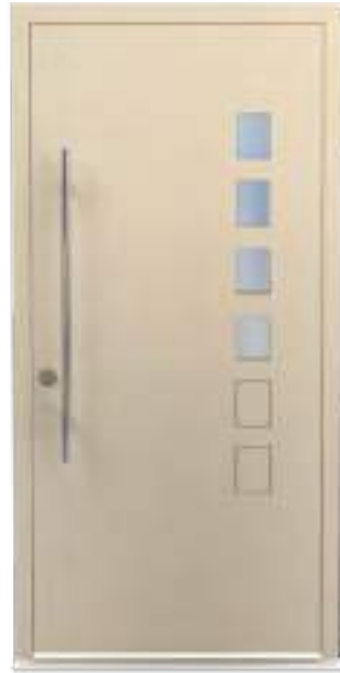
Colour: CWD004 Mayfair DM0017