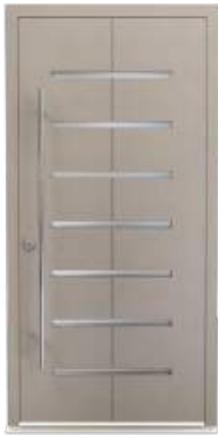
Colour: SEN026 Rushcliffe DM0019