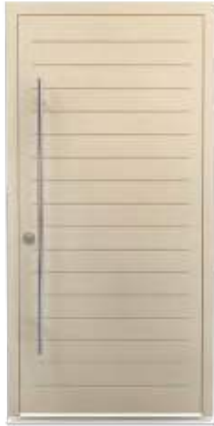
Colour: CWD004 Eastleigh DM0007