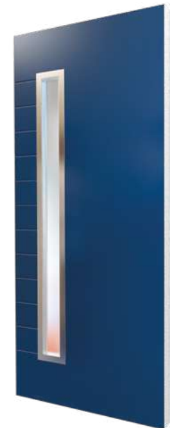
Ocean Blue SEN007