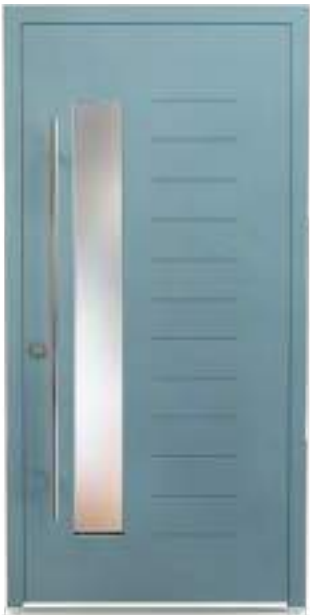
Colour: SEN028 Oakham DM0015