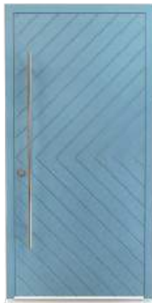
Colour: CTN002 Somerton DT0012