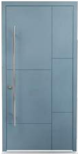
Colour: SEN028 Teddington DM0024