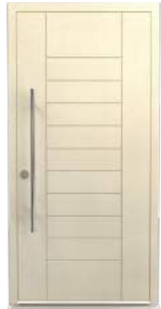
Colour: CWD002 Bloomsbury DM0003