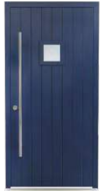
Colour: CTN001 Churchill DT0010